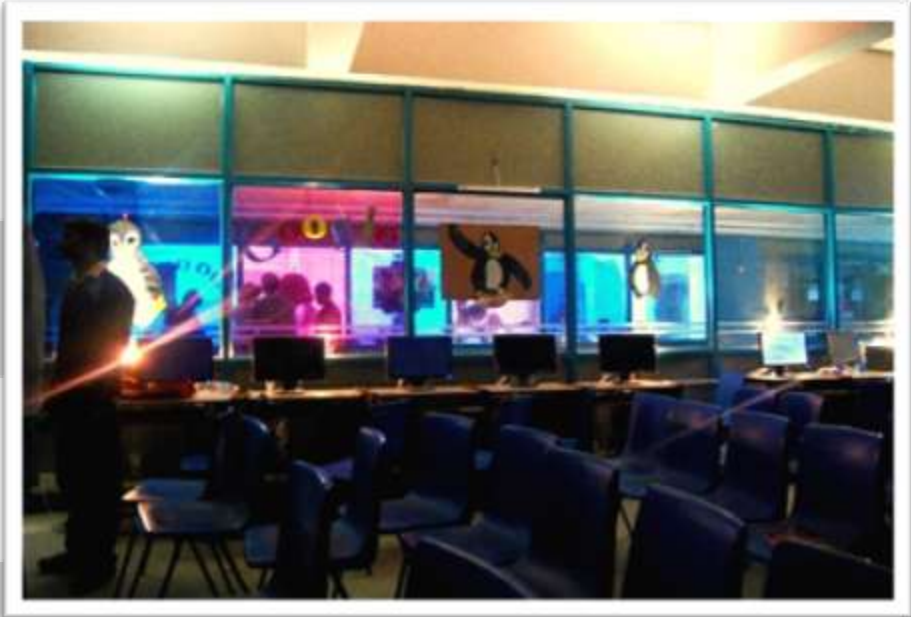
computer labs with custom light effects for midnight hackfests