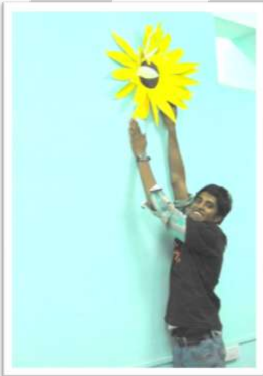
skbohral23 with sahana sunflower