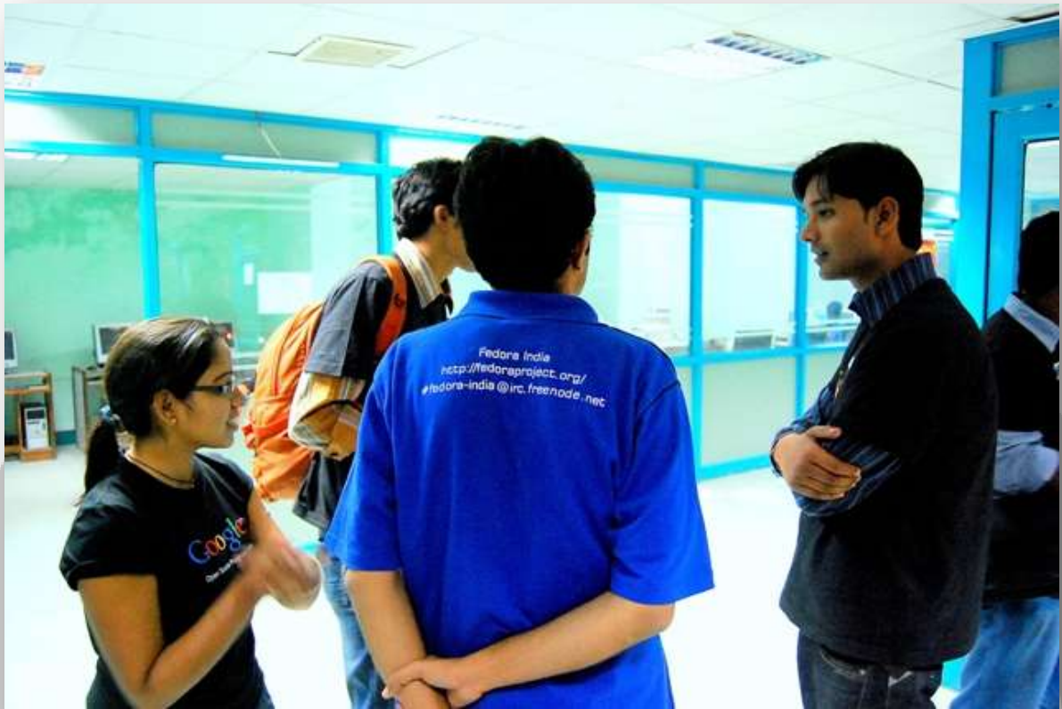
FOSS team involved in some discussions