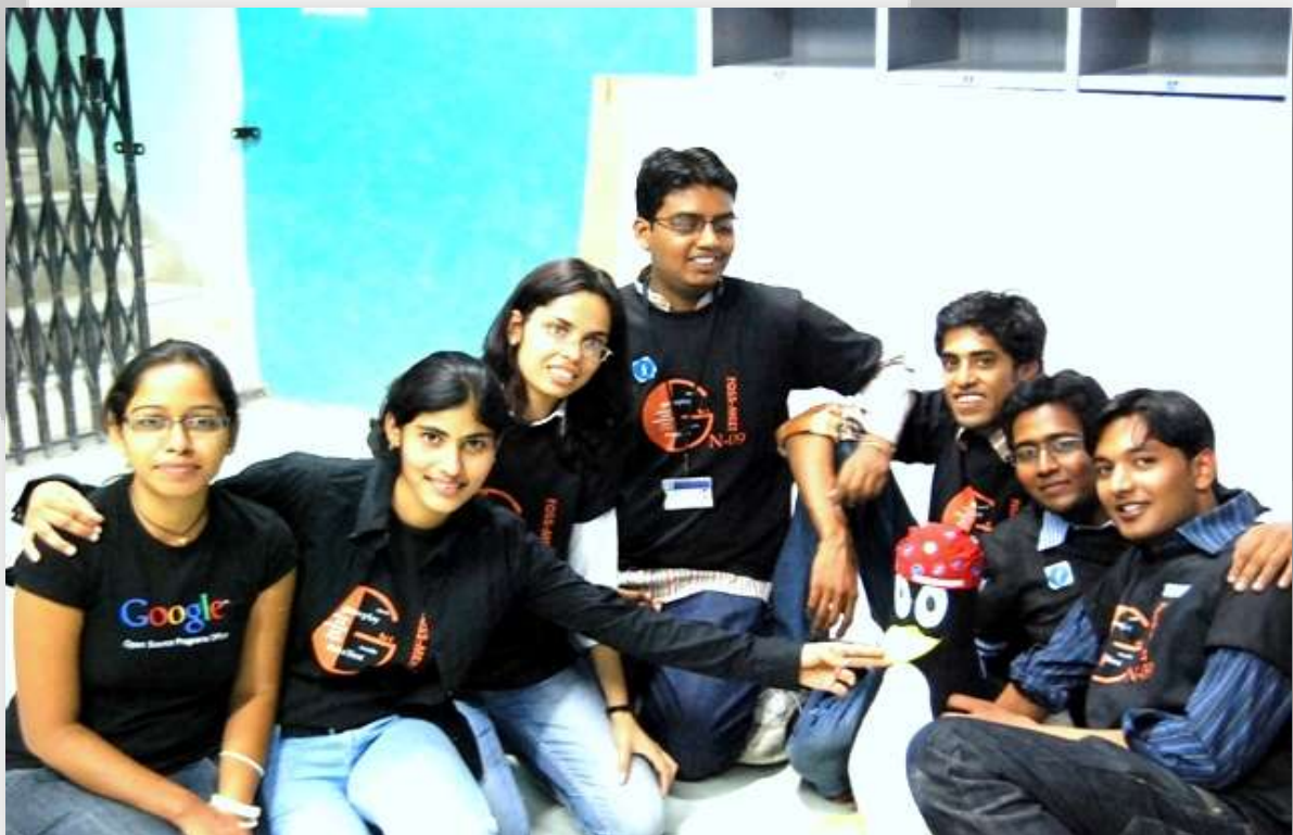
Team members with the POP tux prepared by the art team