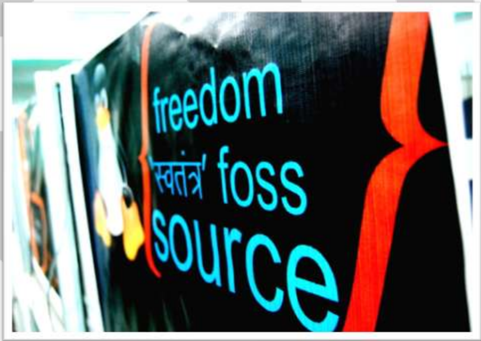
one of the posters at the talks venue