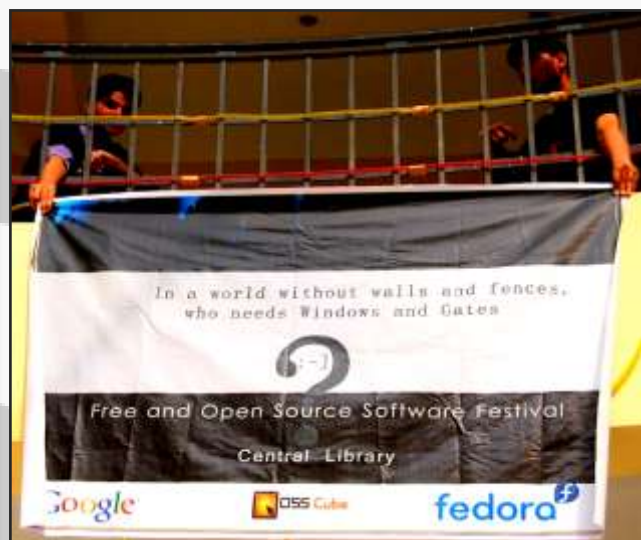
The artwork, the fedora installation, hanging banners for the event