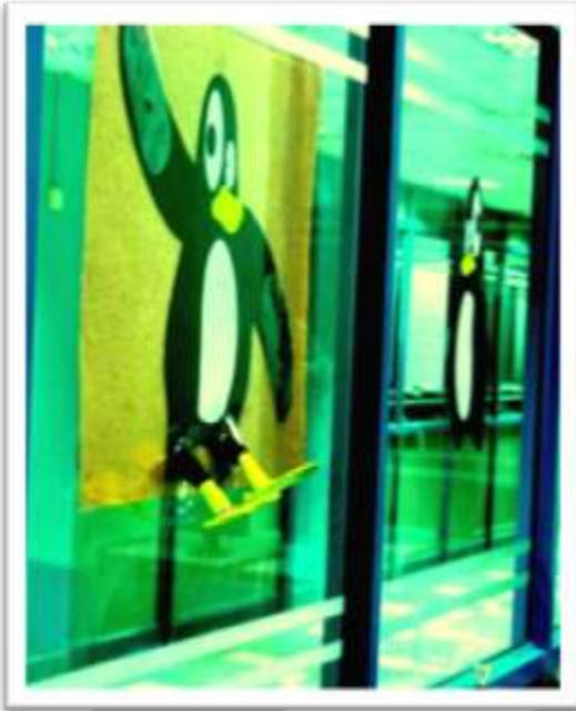
3D tux prepared by our art team